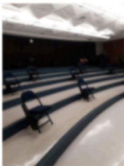
The PHS choir room setup for in person singing

Helming states "Due to its aerosol nature, all wind instruments and singing have been heavily restricted. The result has been no choir work and limited band work. Mr. Talotta and I have had to retool how we teach and approach working with students to find ways