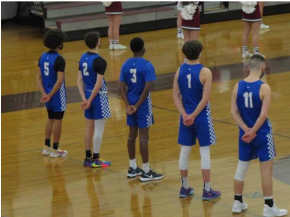
Plainville boys basketball team five starting seniors right before tip off