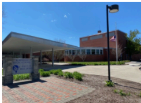
Plainville High on a Spring afternoon after school is finished